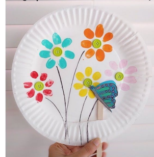
PLAYFUL SPRING CRAFT Fingerprint Flowers with Butterfly